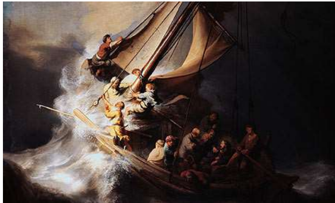
“The Storm on the Sea of Galilee”

Rembrandt is the 14 th person on the boat