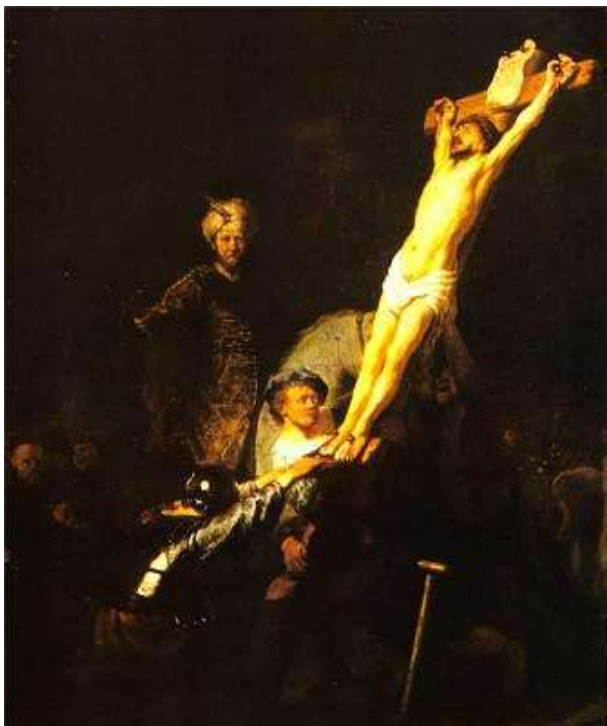
“The Raising of the Cross.”